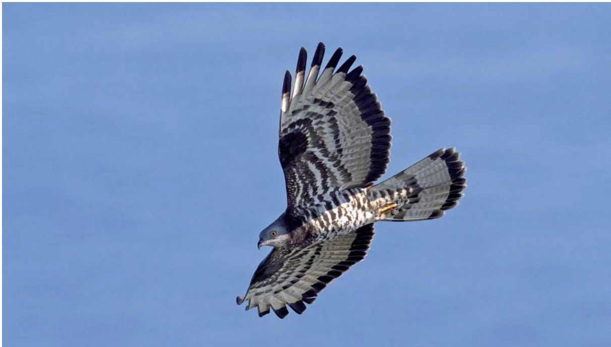
Fig. 2 - An adult male European Honey Buzzard during the crossing of the Tyrrhenian Sea along the Central Mediterranean flyway. May 2011.

stronger tendency to cross larger stretches of sea in spring rather than in autumn. In particular hundreds of individuals concentrate each autumn over the island of Antikythira en route to Crete and Africa, while during spring European Honey Buzzards are expected to bypass the island probably choosing a more direct route between Libya and Greece (Agostini et al. , 2012; Panuccio et al. , 2013a; Fig. 1).