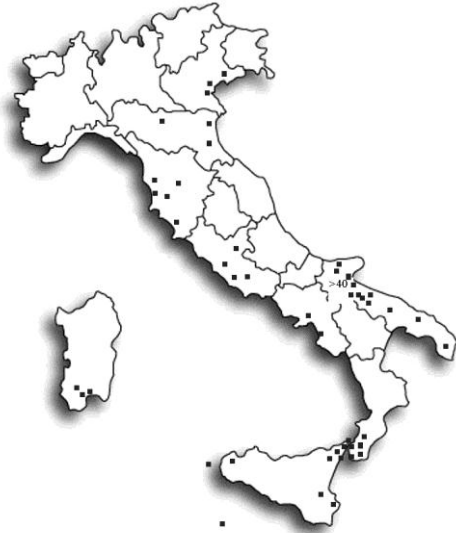
Figure 1. Past records (1800–1986) of Saker Falcon ( Falco cherrug ) in Italy. Most records are concentrated in the Puglia region, with >40 specimens collected (see text) and between Calabria and Sicily, chiefly at the Strait of Messina area. It was quite frequent in Central Italy but fairly scarce in Northern Italy.