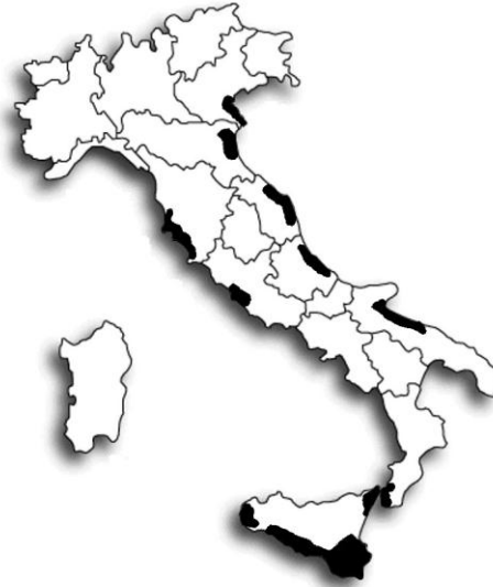
Figure 2. Recent Italian records (1987–2012) of Saker Falcon ( Falco cherrug ) in Italy. Most records are concentrated in Sicily, where it is a regular wintering and migrant bird at the Strait of Messina area. It is also regular, chiefly during winter, in Central Italy (like Lazio, Tuscany, Abruzzo and Marche) while it is scarce in Northern Italy.