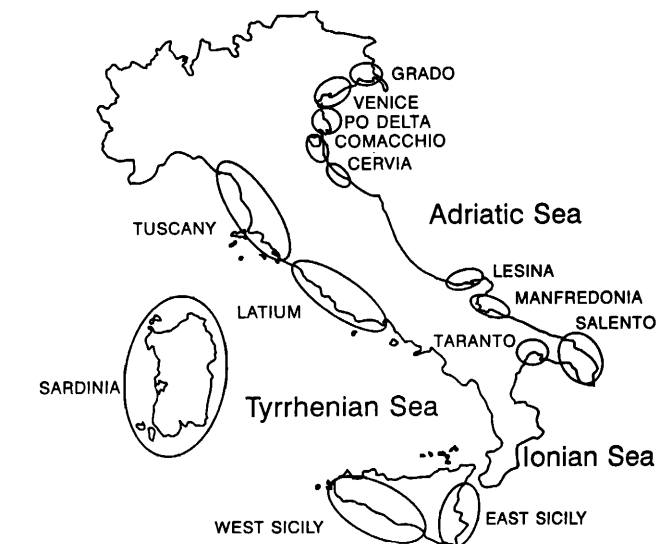
Figure 1. Map of Italy showing the different counted areas.

GRADO: Lagoon of Grado-Marano (ca. 17,000 ha), Isonzo mouth and northernmost Adriatic seashores, with offshore sandbanks. Average spring tide range: 90 cm. The area includes two Ramsar sites (total 1 650 ha) and some no-shooting sites. Data given is from 1991 (Baccetti et al. 1992), 1994, 1995 and 1996. Counts were made by 'Osservatori Faunistici' of Friuli - Venezia Giulia.